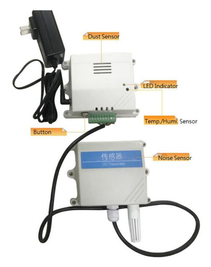
Figure 6 RA0716 internal dust and temperature and humidity Sensor (subject to the actual object)

RA0715 is connected to CO2 and temperature and humidity Sensor (subject to the actual object)