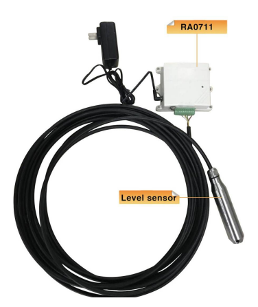
Figure2 RA0711 renderings (subject to the actual object)

Figure 1 RA0701 renderings (subject to the actual object)