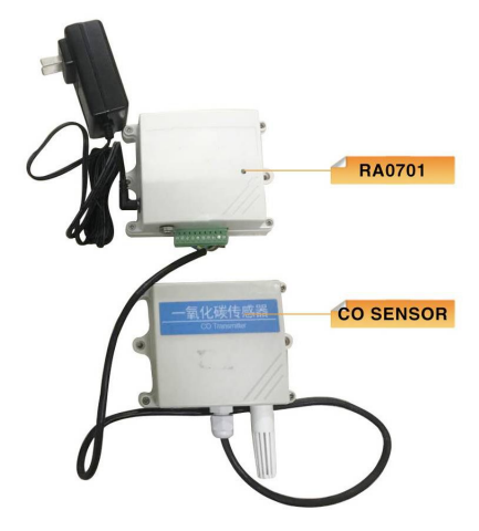
Figure 1 RA0701 renderings (subject to the actual object)