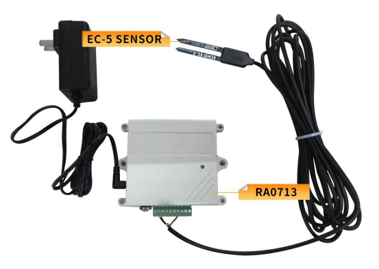
Figure 4 RA0713 external EC-5 SENSOR ( subject to the actual object)

Figure 3 RA0713 external 5TE-SENSOR (subject to the actual object)