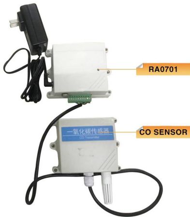
Figure 1 RA0701 renderings (subject to the actual object)