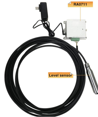
Figure2 RA0711 renderings (subject to the actual object)