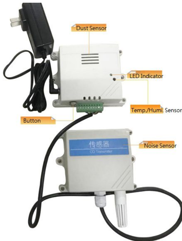
Figure 7 RA0723 internal dust and temperature and humidity sensor, external noise Sensor (subject to the actual object)